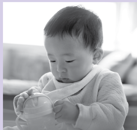
Let me start using a cup to drink water.

By age 1, your baby should drink from an open cup at meals and snack times. Keep helping your baby practice drinking from a cup.