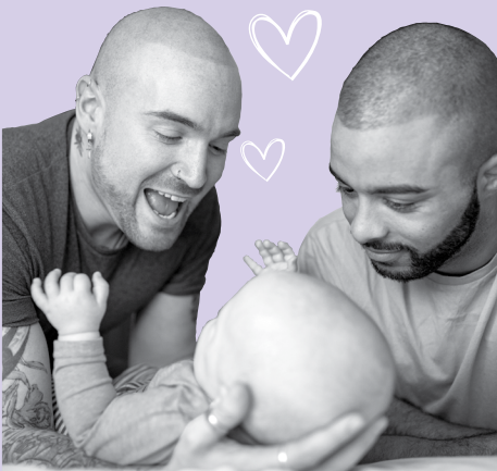
Talk to me. It helps my brain develop.

Your baby may start to be more comfortable around people they spend the most time with and may be more anxious around strangers. Remind everyone who takes care of your baby how important they are to your baby.