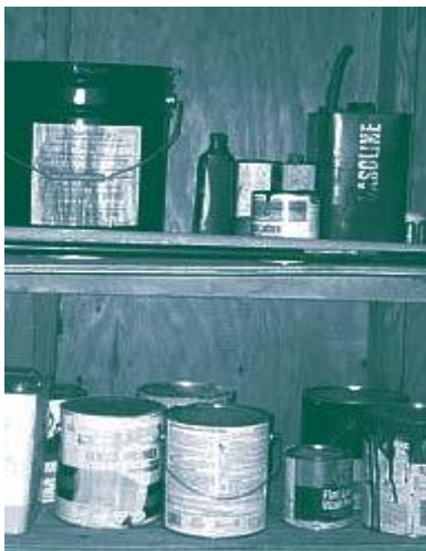
Do not store hazardous materials in the SCA.