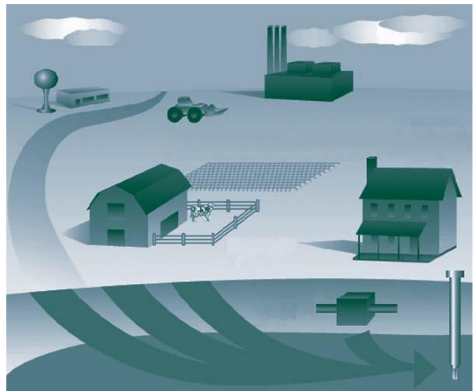
The SCA immediately surrounding a well or surface water intake is part of a larger protective boundary called the source water or wellhead protection area.