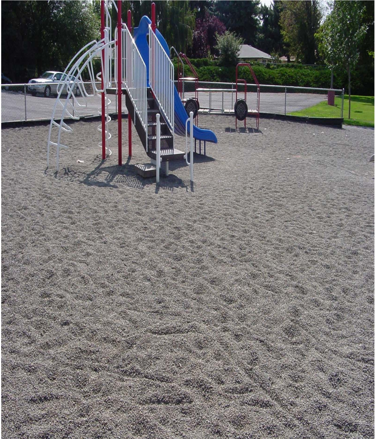
Figure 3. Playground field at Robertson Elementary School, Yakima, Washington.