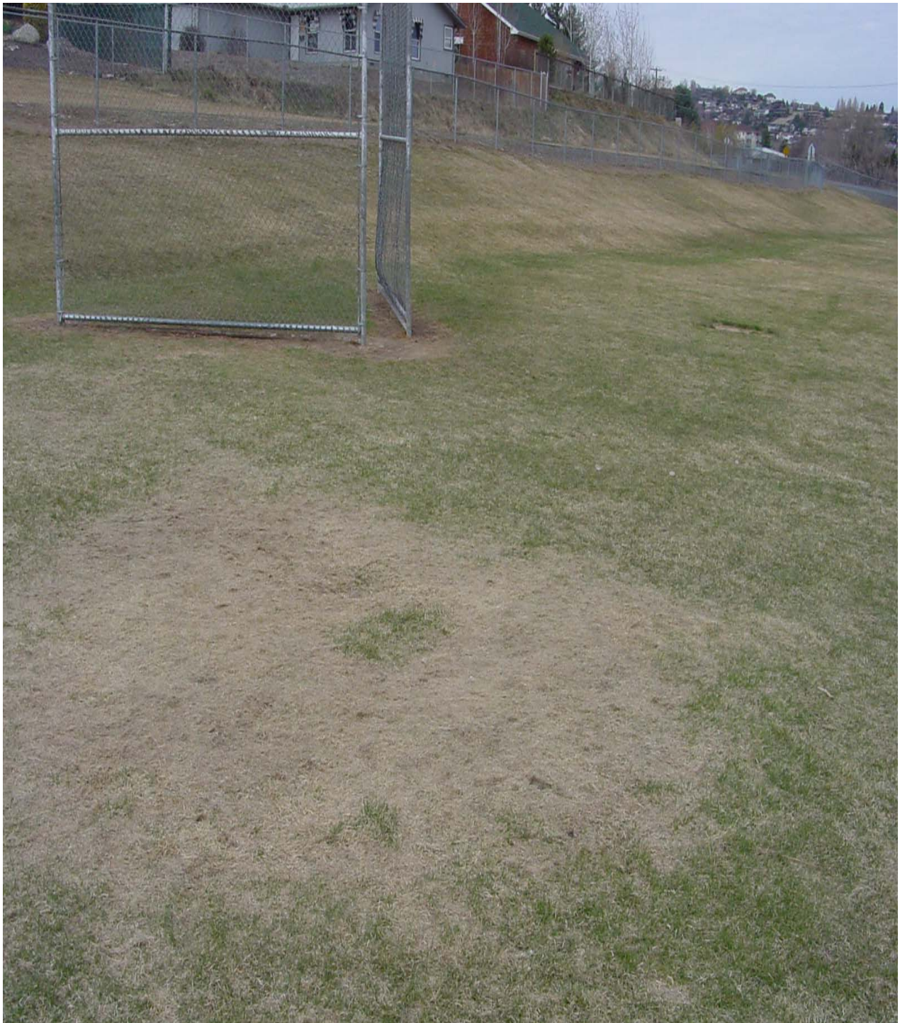
Figure 4. Robertson Elementary School playfields, Yakima Washington.