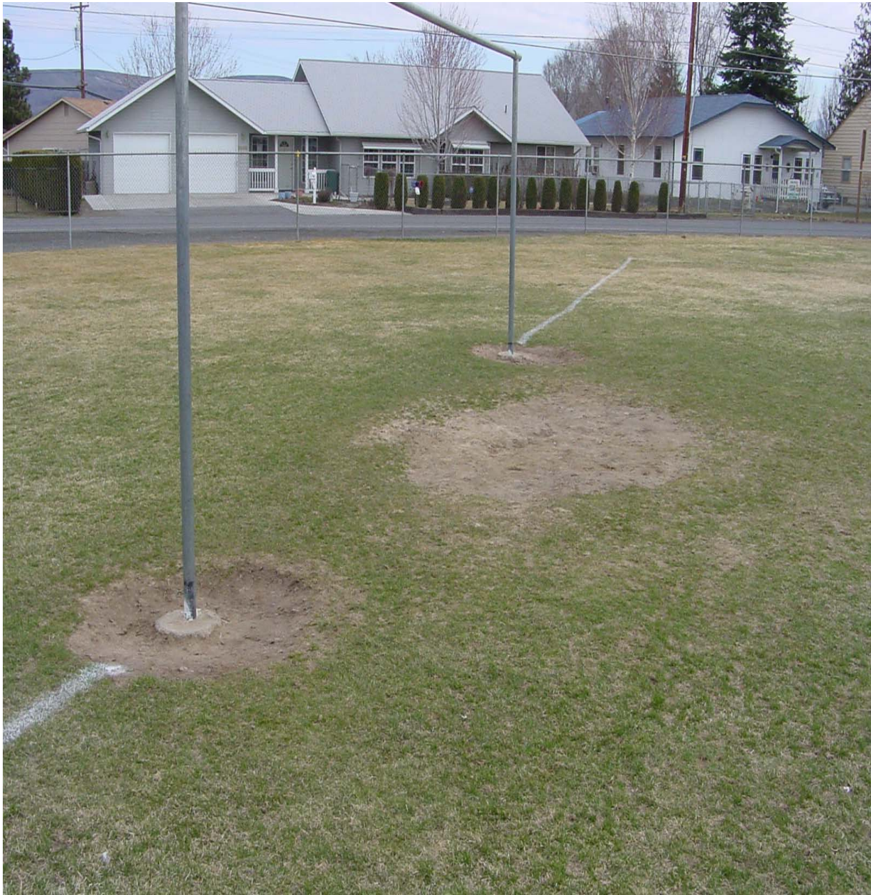
Figure 2. Exposed soil along soccer field, Robertson Elementary School, Yakima, Washington.