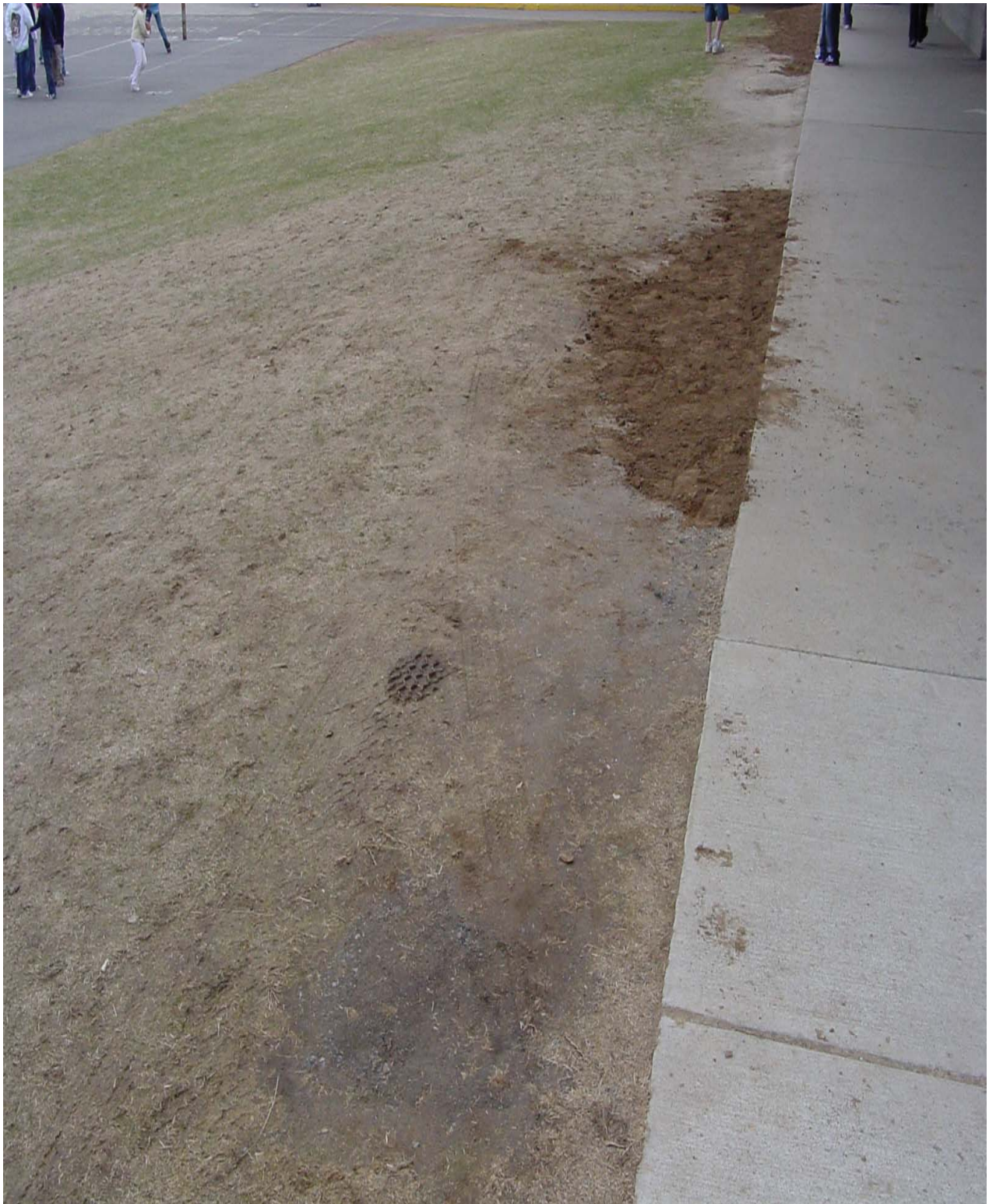
Figure 5. Robertson Elementary School playfields, Yakima Washington.