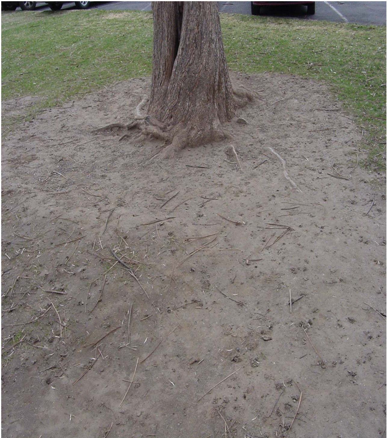
Figure 6. Exposed soil along trees, Robertson Elementary School, Yakima Washington.