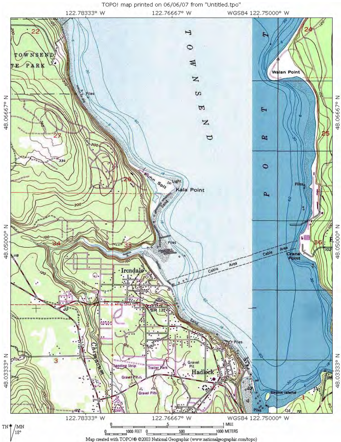
Figure 1. Port Townsend Bay, Irondale Beach Park Shellfish Growing area, Jefferson County Washington State