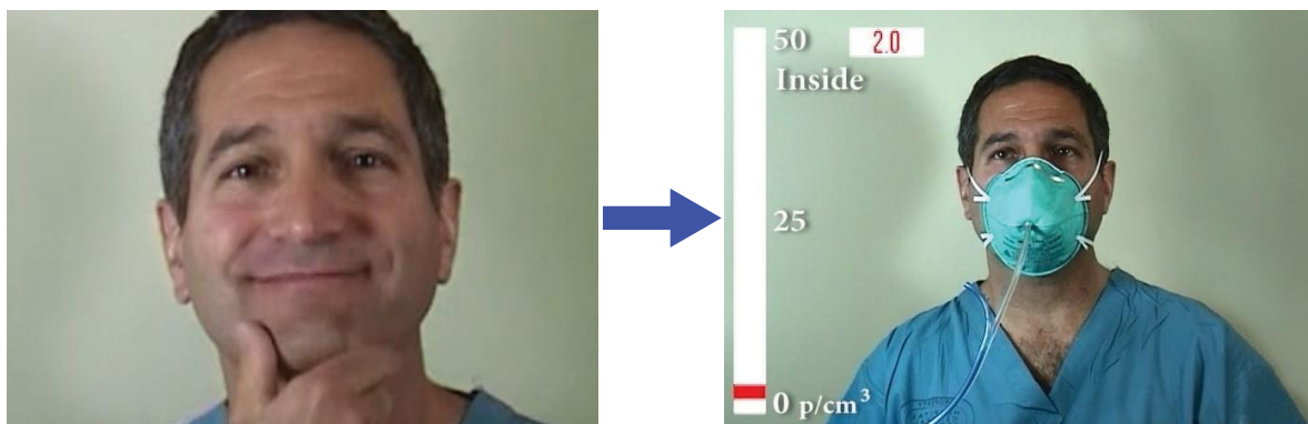
Clean Shaven: Particles Near 0

Staying clean shaven ensures your respirator fits correctly providing you with the best possible protection!