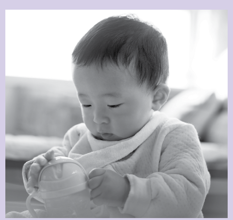
Let me start using a cup to drink water.

By age 1, your baby should drink from an open cup at meals and snack times. Keep helping your baby practice drinking from a cup.