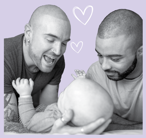
Talk to me. It helps my brain develop.

Your baby may start to be more comfortable around people they spend the most time with and may be more anxious around strangers. Remind everyone who takes care of your baby how important they are to your baby.