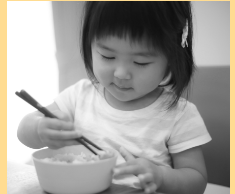
Eat with me and offer something from each food group.

For more nutrition information and resources, visit doh.wa.gov/nutrition-education .