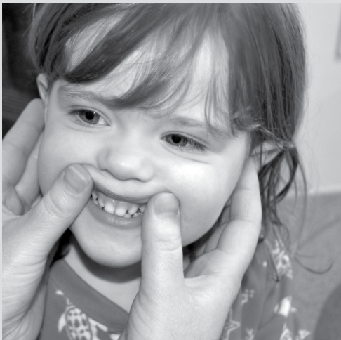
Lift my lip to check my teeth for pale or dark spots.

If your child has not had a first dental checkup, now is the time. Call your child's dentist to make an appointment. For help finding dental care, call the Family Health Hotline at 1-800-322-2588 or go to helpmegrowwa.org .