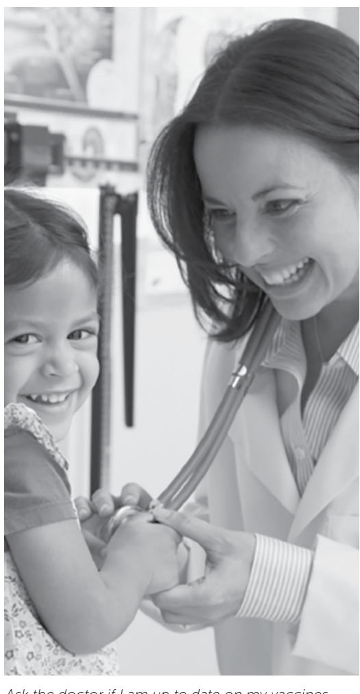
Ask the doctor if I am up to date on my vaccines.