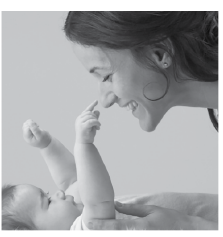
I enjoy every moment next to you.