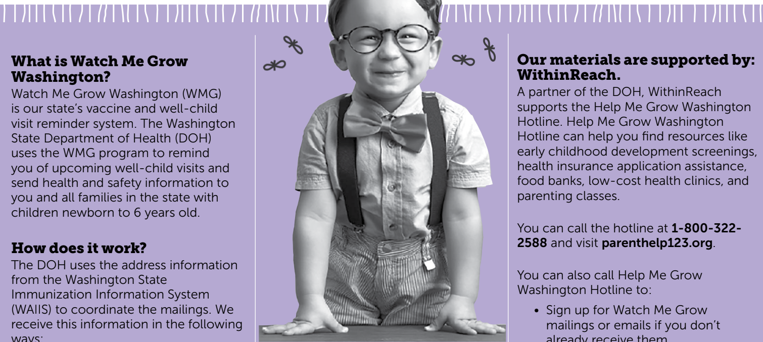
Watch me learn and grow.

These records tell us to start sending you the Watch Me Grow Washington mailings.