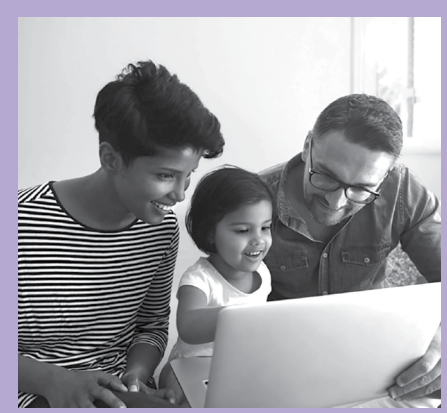
Let's find my vaccine records online!