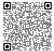
Breakfast Cereal Guide

Many cereals lost WIC approval based on the size. To review each brand and type of cereal removed, scan this QR code or go to https://doh.wa.gov/sites/default/files/2022-02/961-1253-TipsForBuyingWICBreakfastCereal-en.pdf?uid=62b4b0729f1b5 . The website lists package sizes no longer allowed in red.