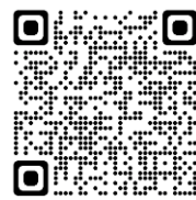
WIC Shopper App