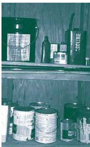
Do not store hazardous materials in the SCA.