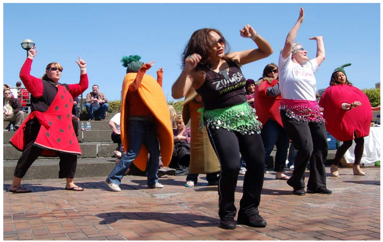
DOH dancers celebrate the opening of the local farmers market in Tumwater.