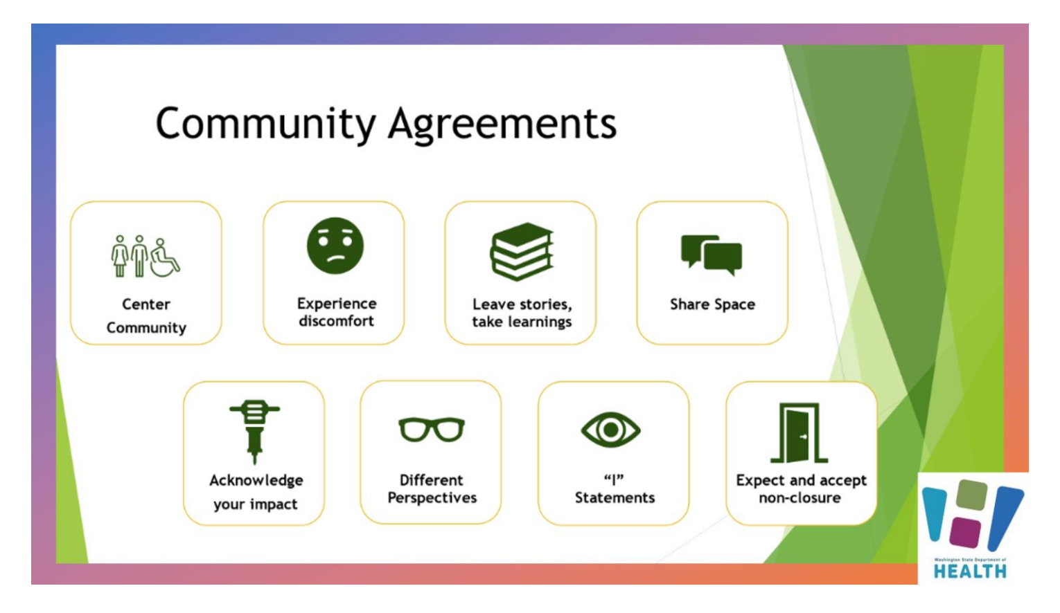
Fig. 2 Steering Committee membership