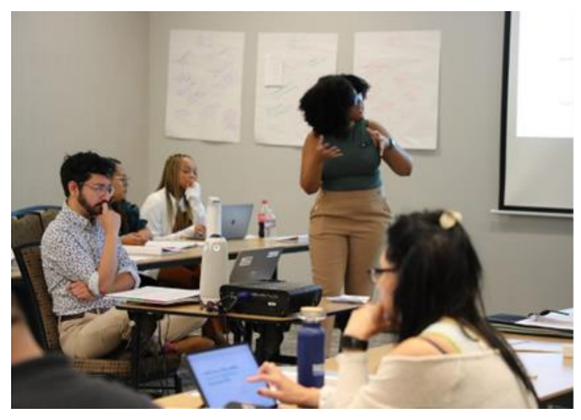
Figure 3: Facilitator speaks to Community Advisory Council

The Rural Communities of Whatcom County have long served as an agricultural center and major port of entry into Washington. With more than 100,000 acres of