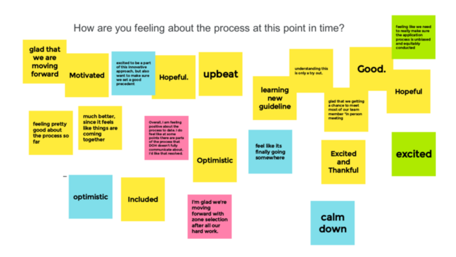
Figure 6: Reflection activity with the Council, January 2023

The evaluation approaches described above will continue to be used by the HEZ Initiative to ensure community members feel supported, that their participation is meaningful, and feedback provided is used to improve the initiative. Strategies developed from the findings may also be shared with other initiatives and programs that are doing community-driven work.