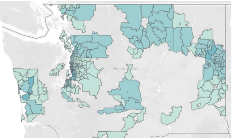
Figure 2: Map of Nominations for Rural and Urban Health Equity Zones Darker blue color indicates areas with a higher concentration of nominations received.

In April 2023, the HEZ Initiative concluded a six-week nomination process for the selection of one rural and one urban zone. A total of 43 complete nominations were received from across 21 counties in Washington. See the map (right) for all community nomination locations.