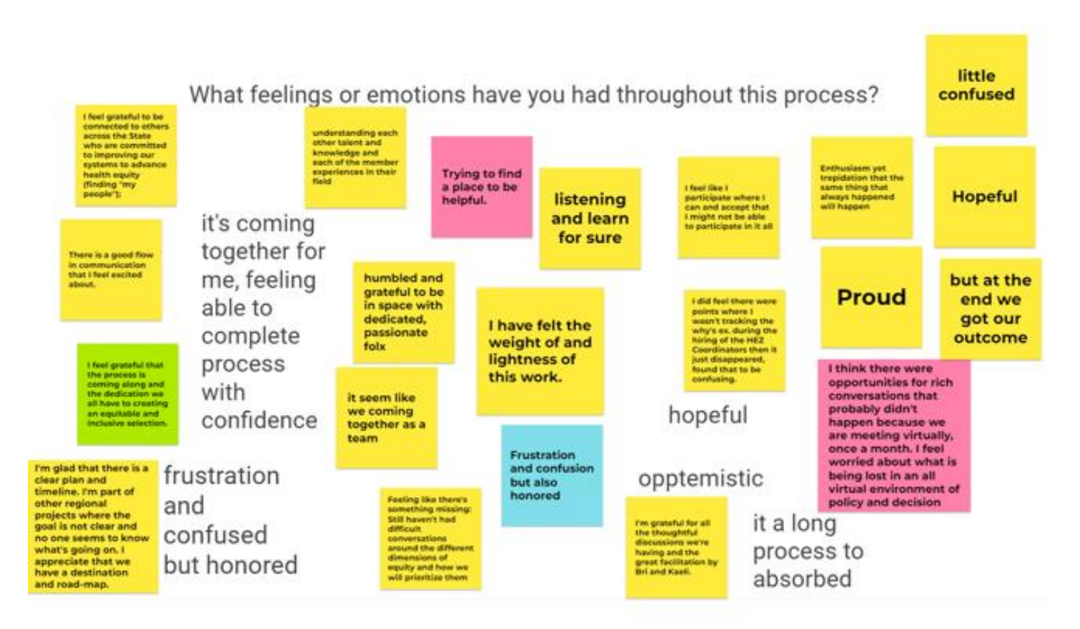
Figure 5: Reflection activity with the Council, August 2022

response to the feedback shared by community members, such as slowing down the process and creating space for more discussion about the priorities of the Initiative.