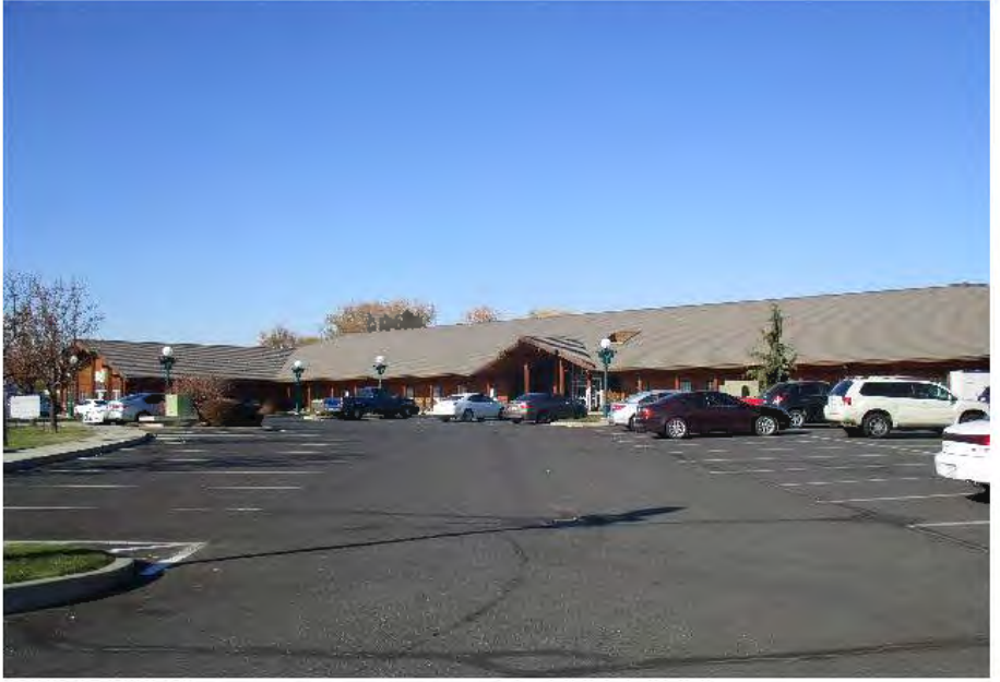
3909 CREEKSIDE LP YAKIMA, WA 98902