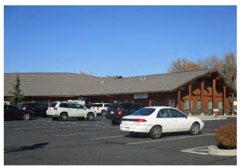
3909 CREEKSIDE LP YAKIMA, WA 98902