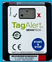
INSTRUCTIONS FOR CONFIRMING PROPER SHIPPING TEMPERATURES