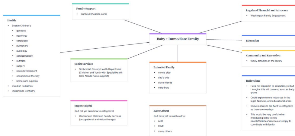
Figure 4: Care Coordination Map from Family Advisory Council Member