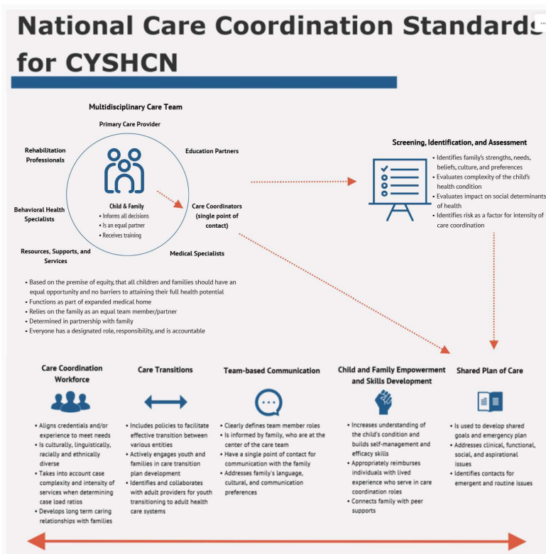
Figure 1: National Care Coordination Standards for CYSHCN