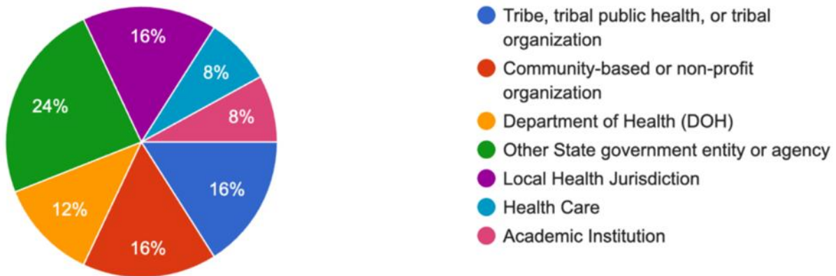
Figure 1: The SHIP Alliance Membership Representation