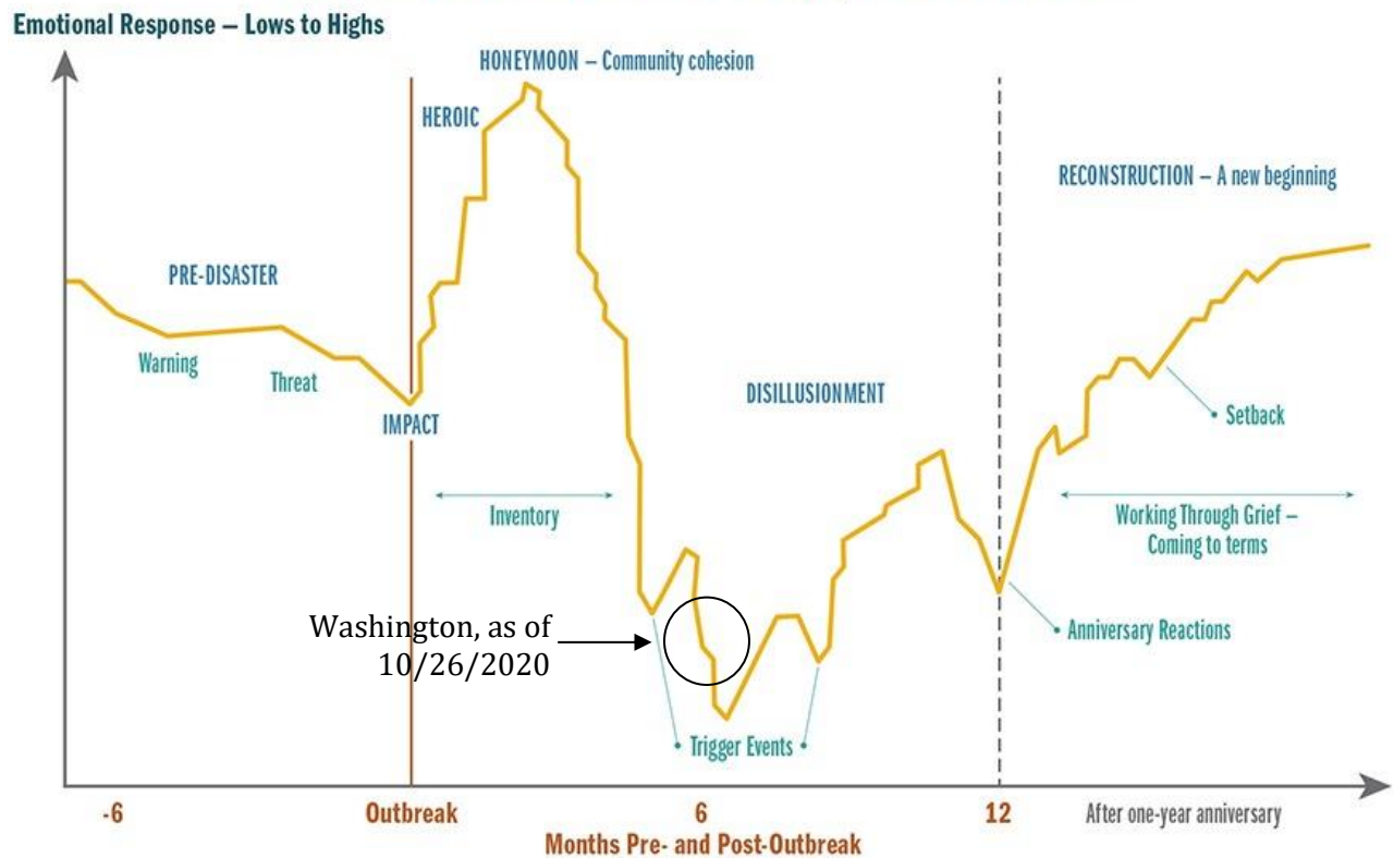
Figure 1: Phases of reactions and behavioral health symptoms in disasters. Adapted from the Substance Abuse and Mental Health Services Administration (SAMHSA) 7