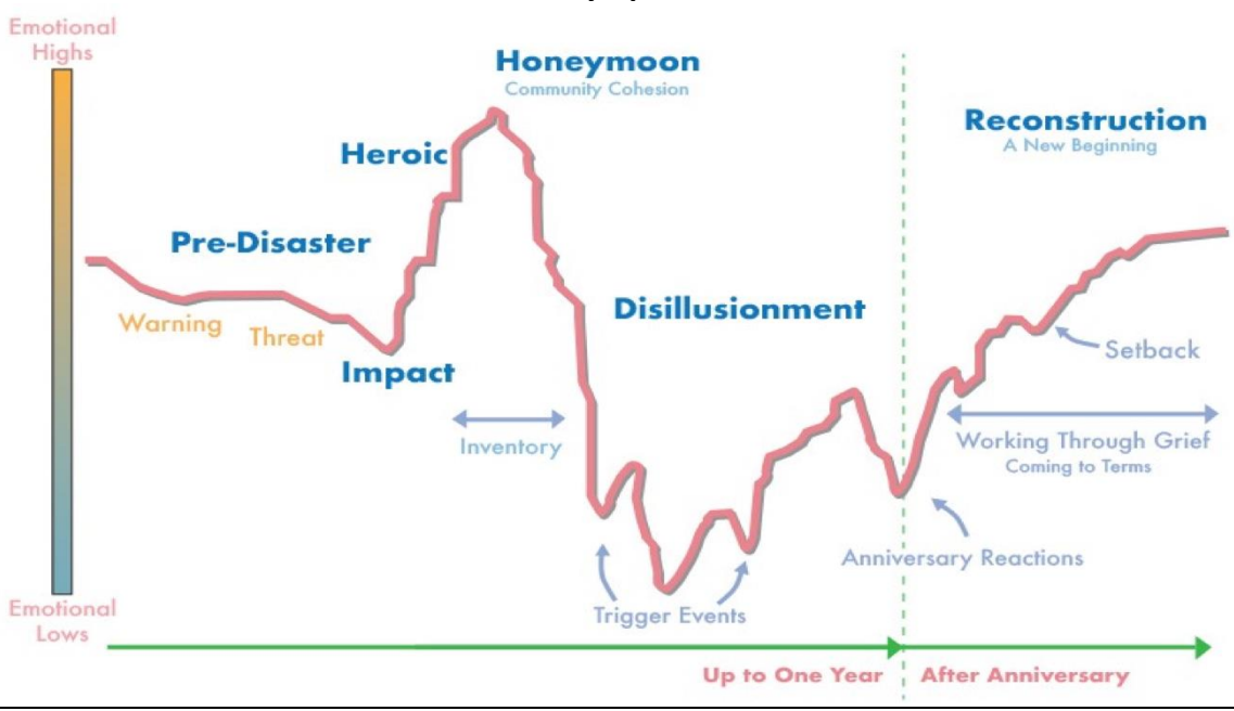
Reactions and Behavioral Symptoms in Disasters: SAMHSA