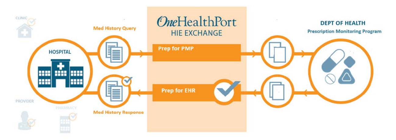
Figure 1: Basic diagram of EHR-HIE-PMP connection

Washington State received a grant from the Substance Abuse and Mental Health Services Administration (SAMHSA) in October 2012 to build a connection to the HIE. Initial connection with the HIE occurred in November 2013. After working through some barriers, the first emergency department connected to the HIE in November 2014.