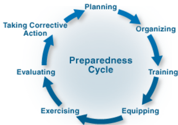
Figure 1. Preparedness Cycle

The preparedness cycle is the process used to develop strong plans and procedures, equipment, response personnel, train staff, and validate those plans, equipment, and training through exercise. It is referred to as a cycle because each action builds on the last to continue improvement and build capability. The preparedness cycle also helps establish a strong culture of continuous strategic improvement in emergency preparedness.