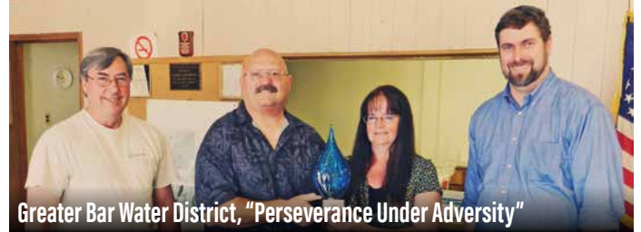
Greater Bar Water District, "Perseverance Under Adversity"