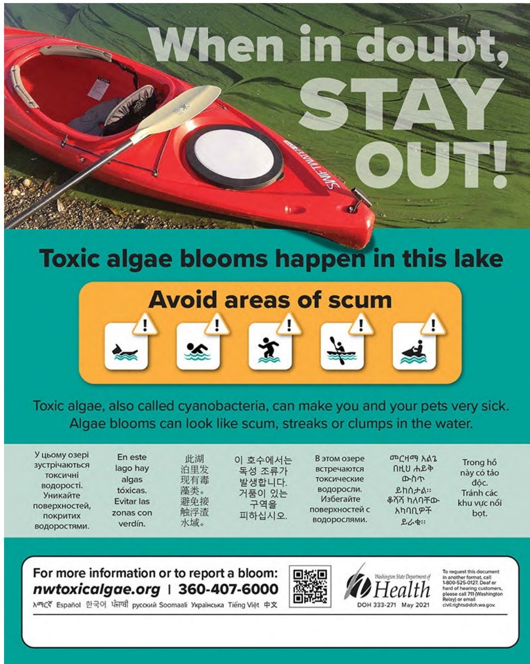
Figure B1: Informational Sign for use in Two-Tier Lake Management Protocol (“When in Doubt, Stay Out!”)

Washington State Recreational Guidance for Microcystins, Anatoxin-a, Cylindrospermopsin and Saxitoxin