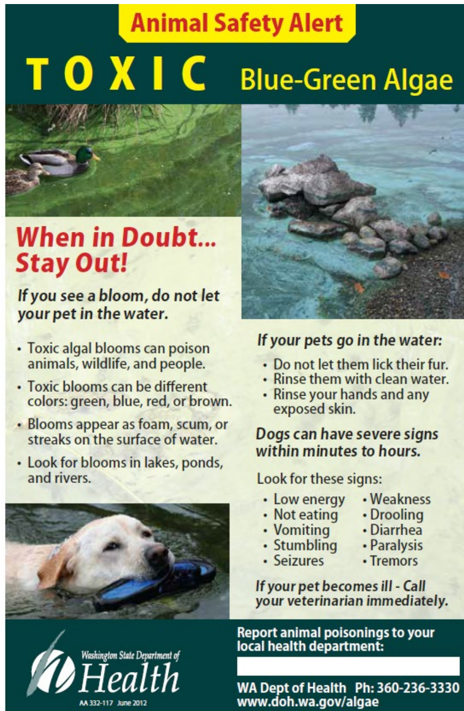
Figure B2: Veterinary Poster for Clinics and for Lake Posting

Washington State Recreational Guidance for Microcystins, Anatoxin-a, Cylindrospermopsin and Saxitoxin