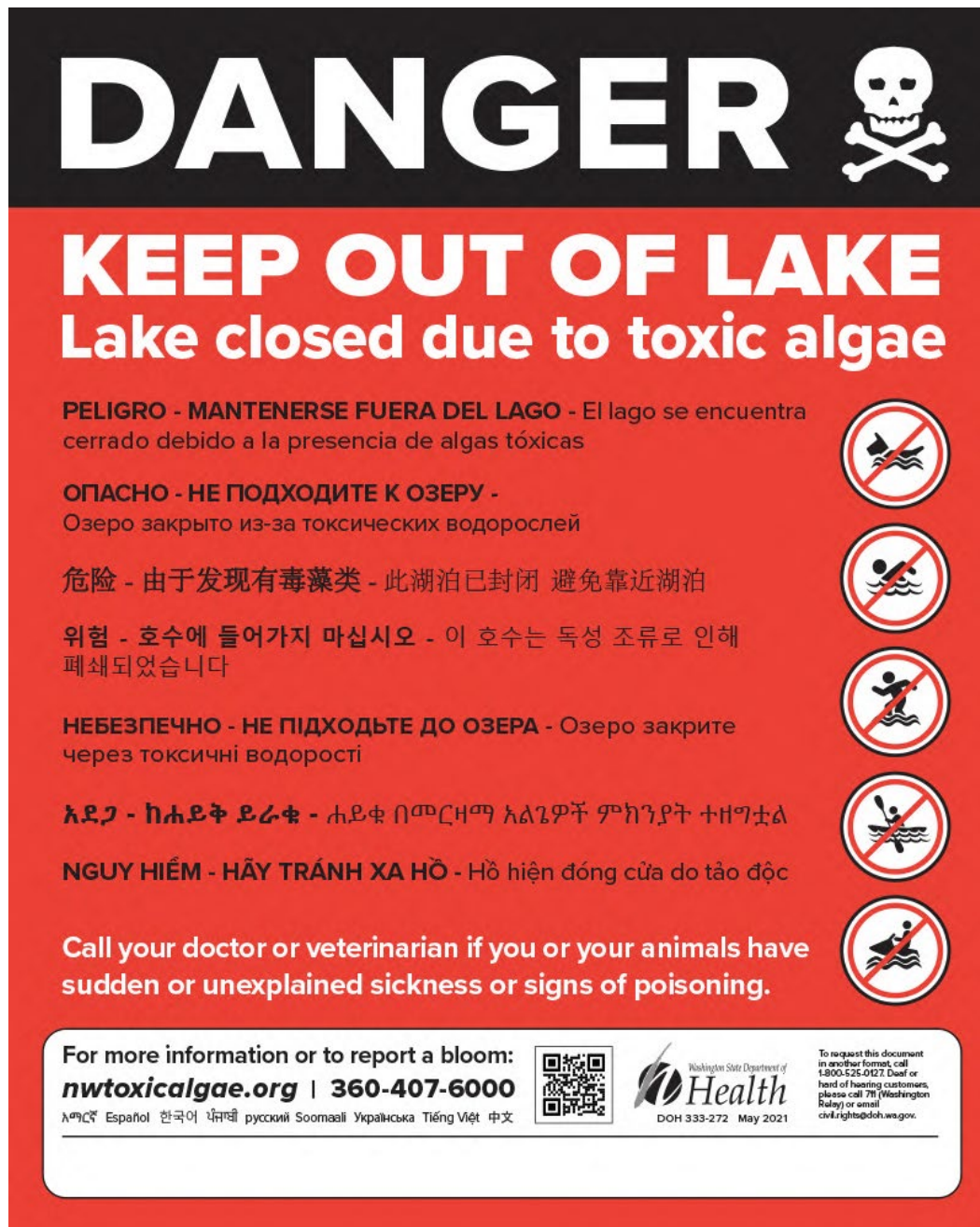
Figure A2: Danger Sign for use in Tier II