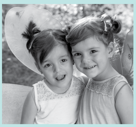
Let me play dress up with friends!

Active play, like running, jumping, and climbing in a safe area, helps your child's body stay active throughout the day and helps them become stronger and well-coordinated. Active play during the day can also help your child sleep better at night.