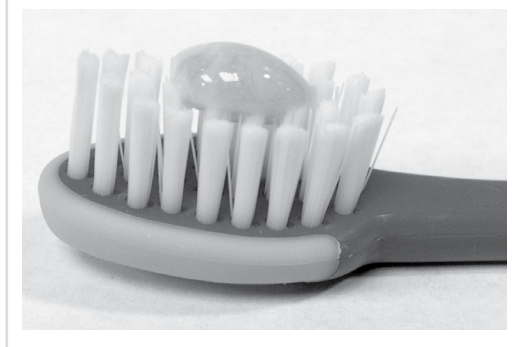
This is the amount of toothpaste I need to brush my teeth.

Want to make brushing fun but need ideas? Visit themightymouth.org .