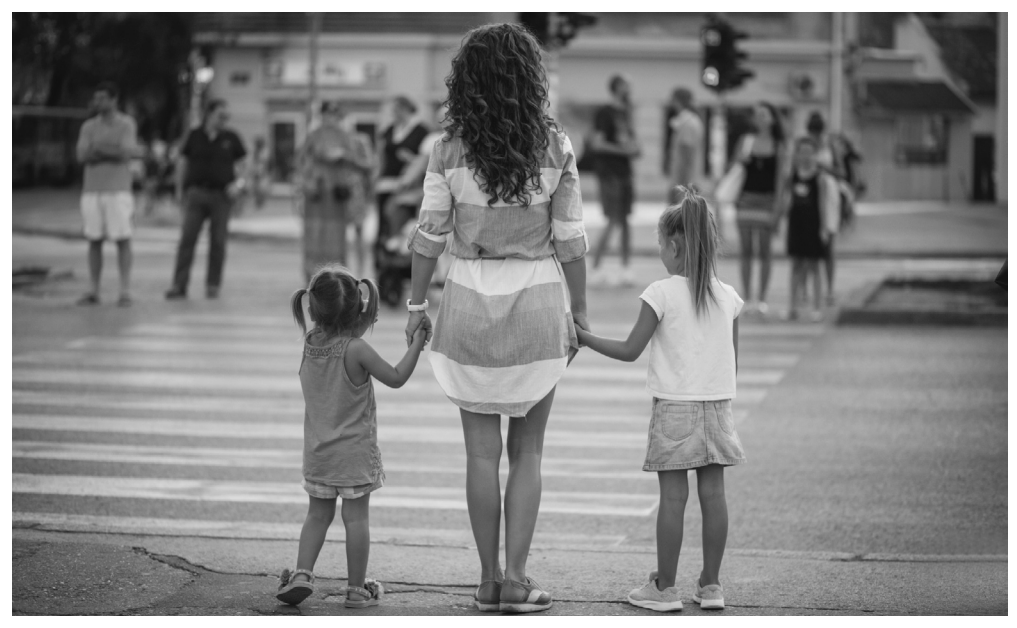
Teach me how to cross the street safely.

Find helpful resources about toilet training and bedwetting at bit.ly/AAPtoilet-training