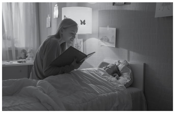
Read me my favorite bedtime story.

Children are happier and learn better if they get enough sleep. School-aged children still need at least 10 to 13 hours of sleep each night. Bedtime should be at the same time every night. A quiet routine may help your child calm down before bed. Read a story or talk about their day. Say good night and let your child fall asleep on their own. End screen time at least 1 hour before bedtime.