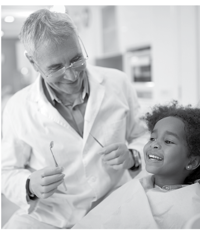
Remember to schedule a dentist appointment for me.

Visit the dentist twice a year. Ask if your child needs sealants, fluoride varnish, tablets, or drops.