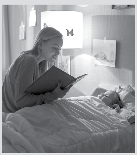
Read me my favorite bedtime story.

Children are happier and learn better if they get enough sleep. School-aged children still need at least 10 to 13 hours of sleep each night. Bedtime should be at the same time every night. A quiet routine may help your child calm down before bed. End screen time at least 1 hour before bedtime. You can read a story together or talk about their day. Say good night and let your child fall asleep on their own.