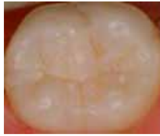
Early Noncavitated Caries