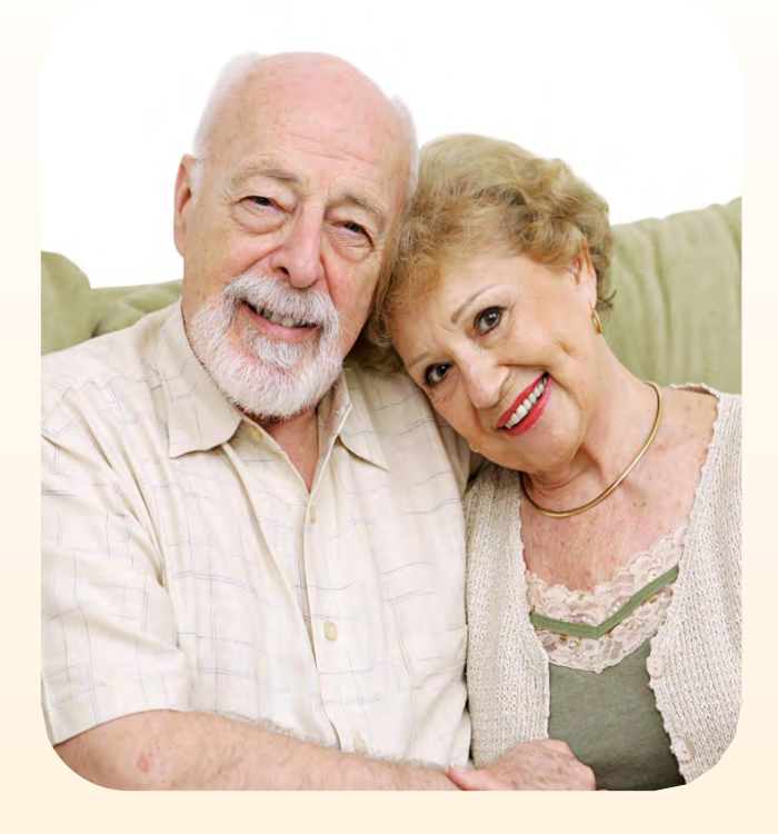
Oral Health Program