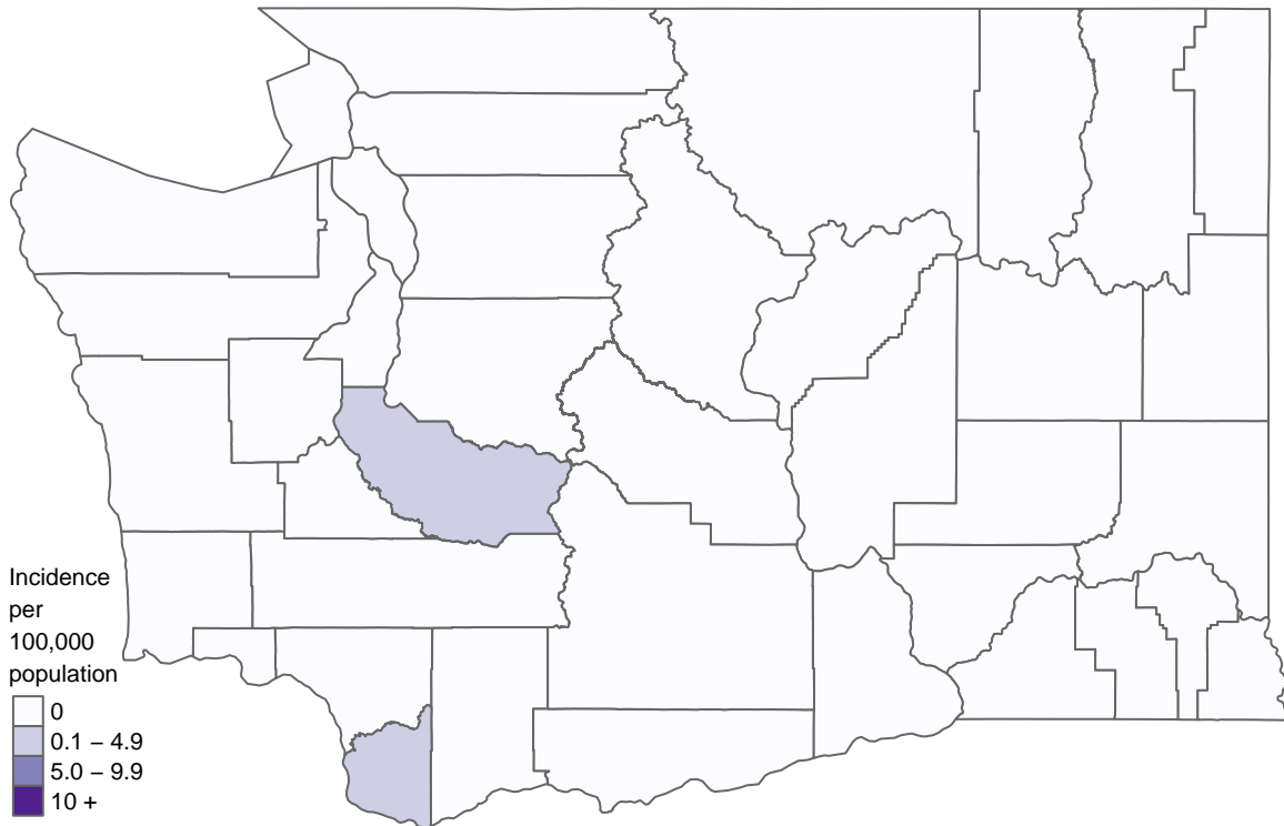
Figure 3: Six-Week Pertussis Incidence Rates by County, 2023 weeks 42 - 48

The incubation period for pertussis is up to 21 days, so six weeks represents two 21-day incubation periods. Outbreaks of pertussis are usually declared over after six weeks have passed with no additional cases. The map above uses the past six weeks of data to highlight areas where the potential for continuing outbreaks exists based on current patterns of reported pertussis disease.