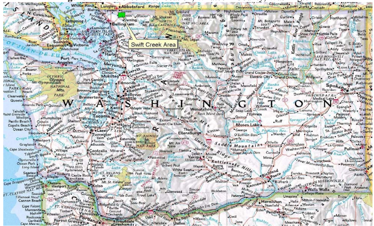
Figure 1. Swift Creek site location, Whatcom County, Washington.